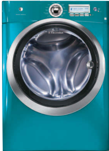
Turquoise Sky EWFLW65H TS

Featuring Wave-Touch™ Electronic Controls